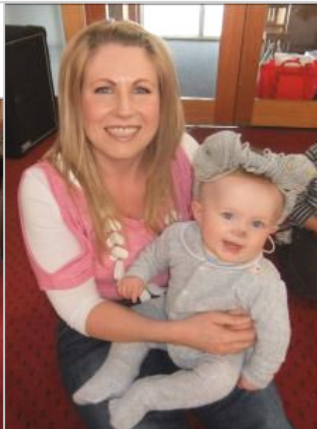
Below: Riverlinks Together BBQ